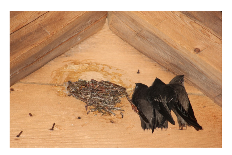
Young swifts huddled at the peak of a barn. (Donna Crossland 2014)