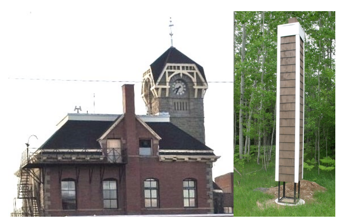
Left: Old Bathurst Post Office showing the roost chimney and iconic clock tower. Right: one of the artificial towers built by Nature NB (Lewnanny Richardson 2014)

Nature NB works on various projects to recover Chimney Swifts in New Brunswick. Our staff and volunteers have built and installed wooden nesting structures on the Acadian Peninsula and elsewhere (photo above right). Swifts have not yet nested in these structures, and do not appear to be attracted by them – at least not yet. The volunteers who have structures on their property are patiently waiting the day when the swifts will take to them.