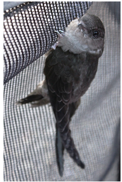
Young swift ready to be released CWRC nestlings and (Ally Manthorne 2013) remained in NS.

fore moving onto Swift Care Ontario in London. This trio was successfully released at a roost site on September 9th and easily joined the resident group of 300+ swifts!