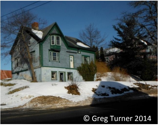
New Bear River roost site

Historically Chimney Swifts roosted in the main Bear River village in a brick chimney in the old Oakdene School. From conversations with locals, we know that different birders and