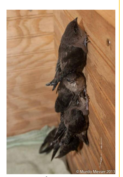
Young swifts practice roosting in a fake chimney before being released.

The fledglings were transported to Middleton Regional High School and quickly took to the sky to join the 100+ adults circling the chimney. They were even greeted by some adults swooping down before they all funneled into the chimney for the night.