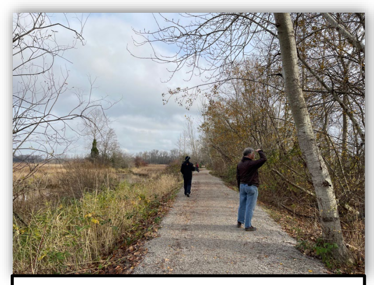
South Arm Marshes, Ladner.

Birds Canada, a BirdLife International IBA partner, held a third successful bird count within the Fraser River Estuary Important Bird Area on November 20, 2021. Sixty-five volunteer surveyors detected 132 bird species and more than 180,000 individuals in this crucial wintering bird hotspot!