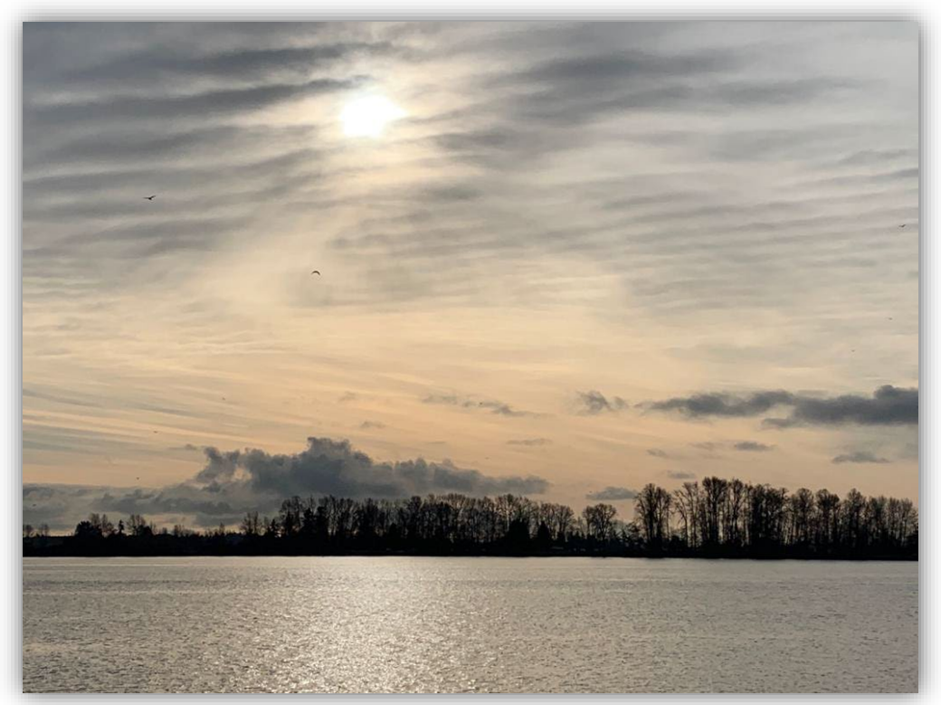
The Fraser River provides essential habitat for countless wintering and migrating waterbirds.

More generally, anyone living near an Important Bird and Biodiversity Area can help monitor their local IBA. Find one near you by exploring <u>this map</u>! Counting and reporting birds through <u>eBird Canada</u> or other <u>Citizen Science projects</u> helps inform decisions that impact IBAs. Learn more about how you can <u>get involved at IBAs</u>.