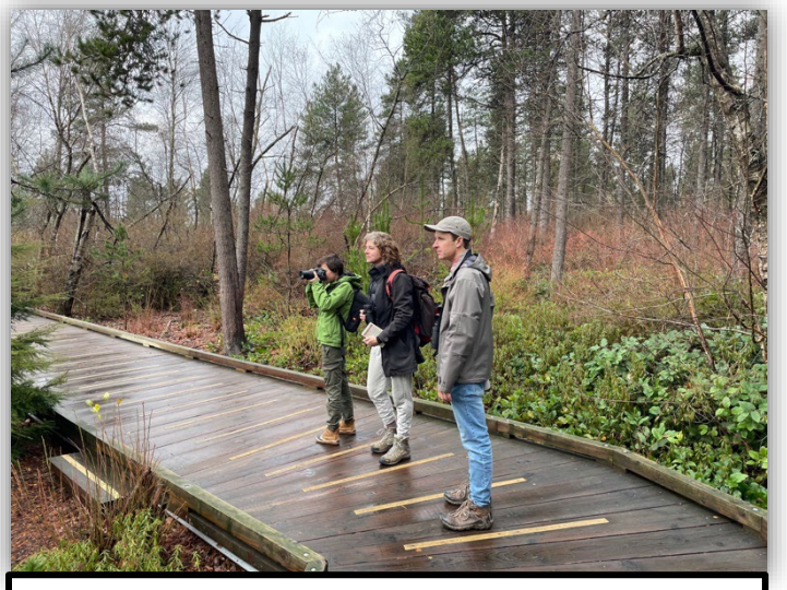
Richmond Nature Park.