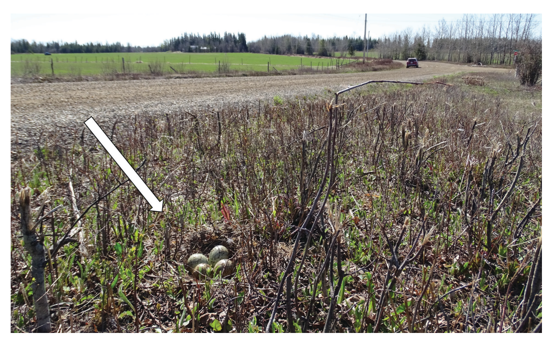
FIGURE 1. Long-billed Curlew ( Numenius americanus ) nest N3 along rural road in Prince George, British Columbia (May 2019) showing four eggs.

seven nests that were successful (fledged), two due to hatch after our field season (still incubating), and two nests that failed during laying and incubation (Figure 2). Within 300 m of N3, we found three other curlew nests, all in relatively uniform hayfield (Figure 2). At the time we discovered N3, the adjacent hay fields all had grass heights <10 cm, making nesting curlews visible at a distance. At the same time, N3 was very well concealed in ~20–30 cm tall, previously-mowed shrubby vegetation. Photos of N3 taken within a day of other nearby nests demonstrate the increased concealment of N3 (Figure 3a,b) relative to N2 (Figure 3c).