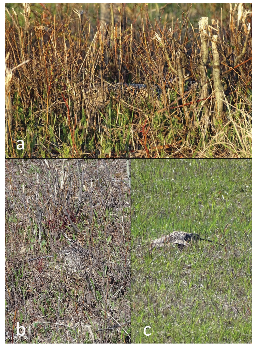
FIGURE 3. Long-billed Curlew ( Numenius americanus ) nest N3 and nearby nest N2 taken within 24 h: a. N3 with female on nest from level of bird in early morning sunlight, 10 May 2019, 0602; b. N3 with female on nest from another angle, 10 May 10, 1026; c. nearby nest (N2) with female on nest, 9 May 2019, 0950.

gensen. 2011. Nest survival of Long-billed Curlew in Nebraska. Wader Study Group Bulletin 118: 109–113.