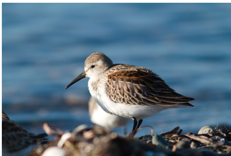
Western Sandpiper, Blackie Spit