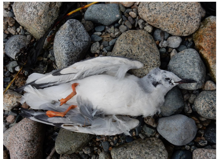
Bonaparte's Gull from Beached Bird Survey, Kitty Castle

The Beached Bird and Coastal Waterbird Surveys of Birds Canada are supported by: