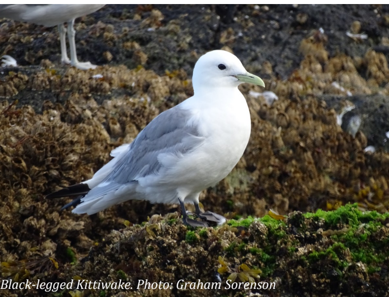
Black-legged Kittiwake.

Throughout the surveys, 46 species of waterbirds were detected, and six of these species were detected at high enough densities that greater than 1% of the North American population could have been in the survey area. These species were Common Murre, Pigeon Guillemot, California Gull, Iceland Gull, Mew Gull, and Red-necked Grebe. Some interesting patterns emerged showing the timing of passage or arrival for different species: scoter numbers increased each week of surveying, Red-necked Phalarope numbers peaked in early September, Common Murre peaked in mid-September, and most gull species numbers decreased through the survey period except Glaucous-winged Gull. You can read a full report on the survey and findings here .