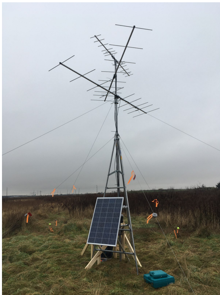
Motus receiver station on Boundary Bay installed in collaboration with Metro Vancouver Regional Parks.

Once the transmitters were on the Dunlin, we needed receiver stations that could detect those tagged birds. This is where the collaborative nature of Motus really came into play. The key to the success of Motus is that all tagged birds can be detected on anyone's receiver. Therefore, the Dunlin we tagged can be detected on receivers maintained by Environment and Climate Change Canada that were already in the area. We also installed two new receivers along Mud Bay and Boundary Bay in collaboration with the City of Surrey and Metro Vancouver Regional Parks. Environment