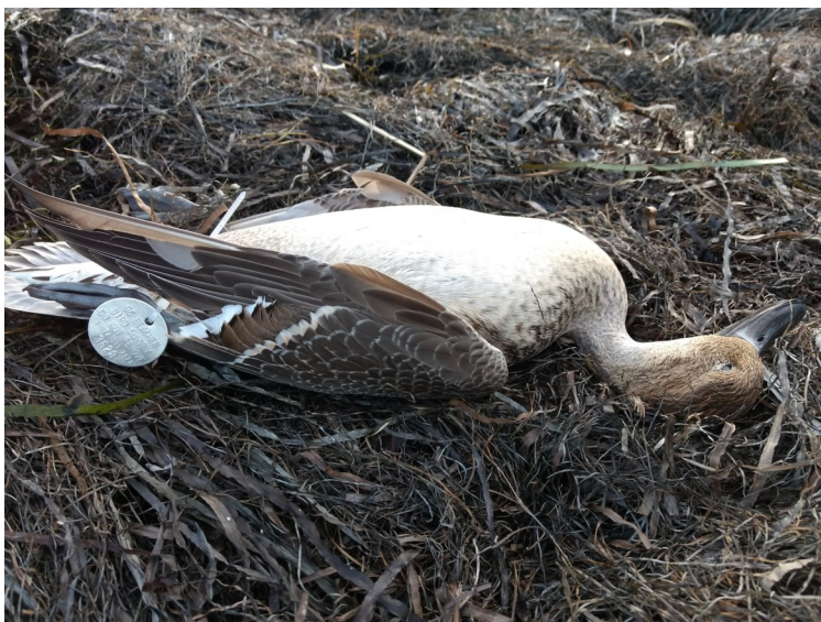
Northern Pintail in Boundary Bay.

The BC Beached Bird Survey is nearing its 20 th contin-