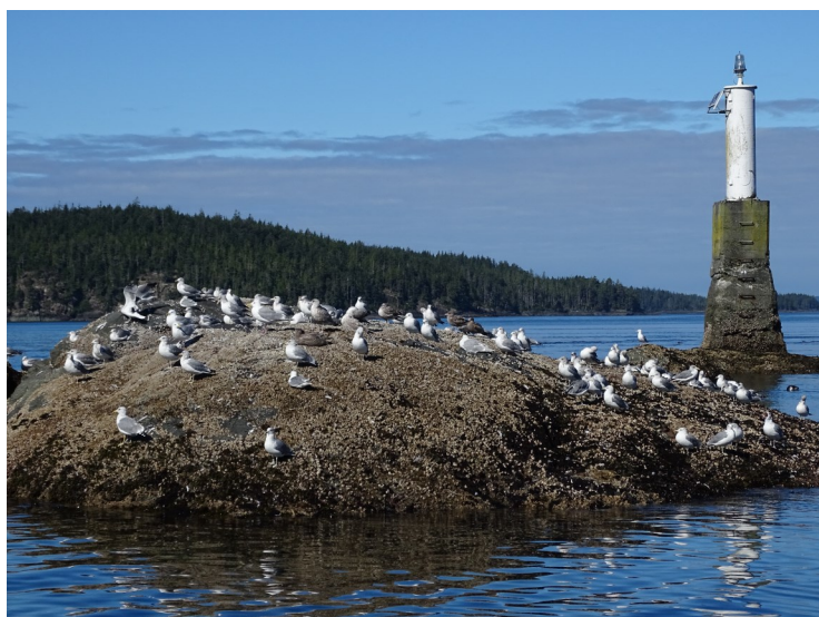
Gull aggregation, Queen Charlotte Strait