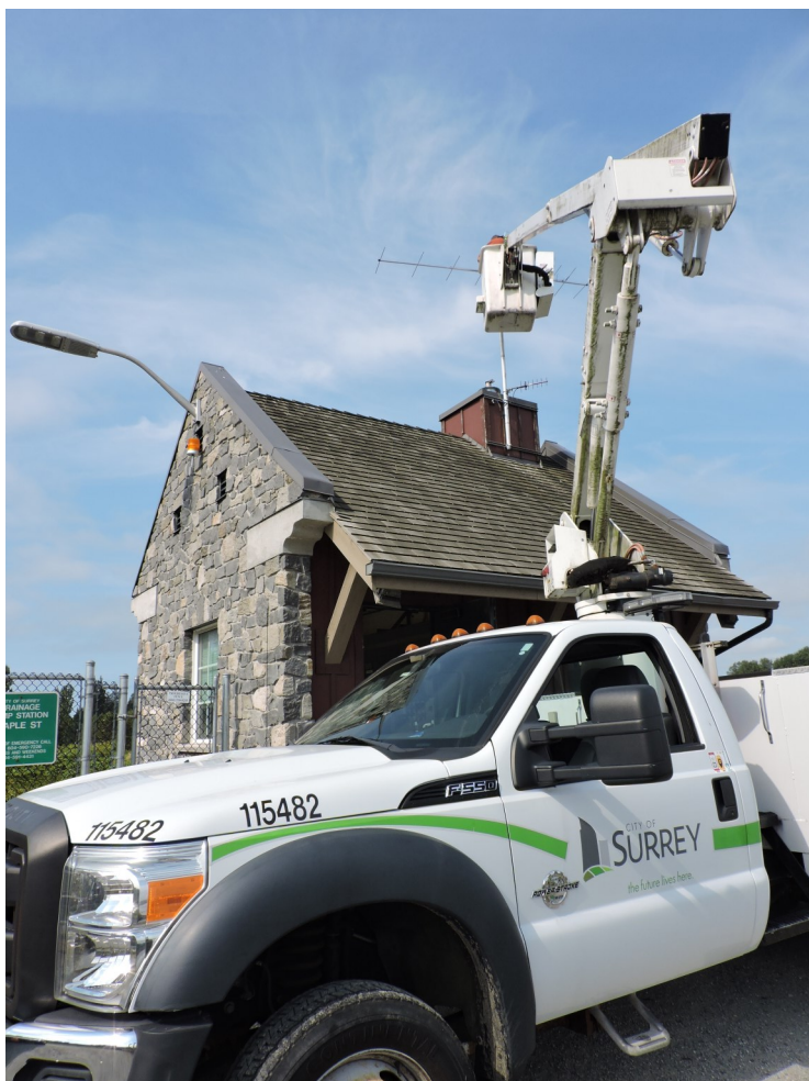
The City of Surrey helping to install a Motus receiver station at Blackie Spit.

Data from the Dunlin continue to come in through the receivers and we are excited to see preliminary tracks of Dunlin moving between Brunswick Point and Boundary Bay. As the Motus Wildlife Tracking System continues to expand in western North America, we are looking forward to seeing where else Dunlin and other shorebirds travel along the Pacific coast. If you have a good location for a Motus receiver station, please contact Amie ( amacdonald@birdscanada.org ).