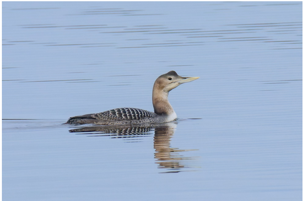
Yellow-billed Loon in Surrey.

In this past season, 170 observers (with 375 assistants) did 1300 surveys at 234 sites across BC! One hundred and eight target species (waterbirds, raptors, and corvids) were detected. Some highlights from the season include; a Yellow-billed Loon near Roberts Creek in November 2019, a Long-billed Curlew at Blackie Spit in October 2019, and a Parasitic Jaeger off Neville Point in September 2019.