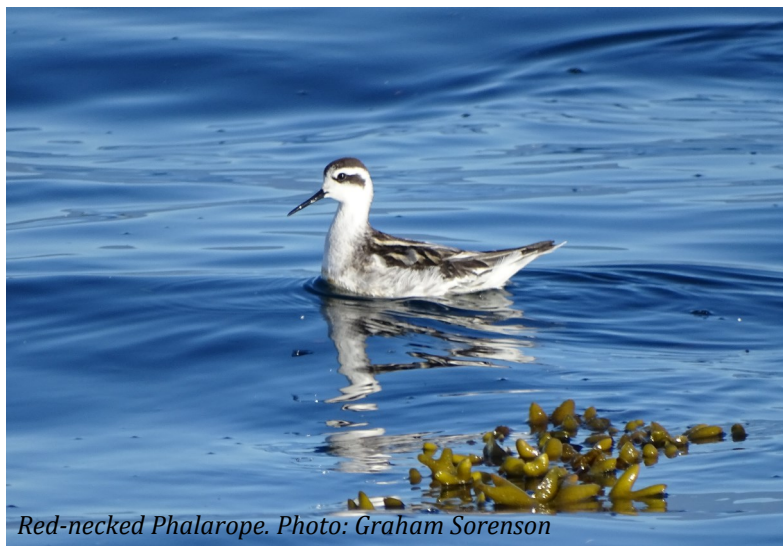
Red-necked Phalarope.