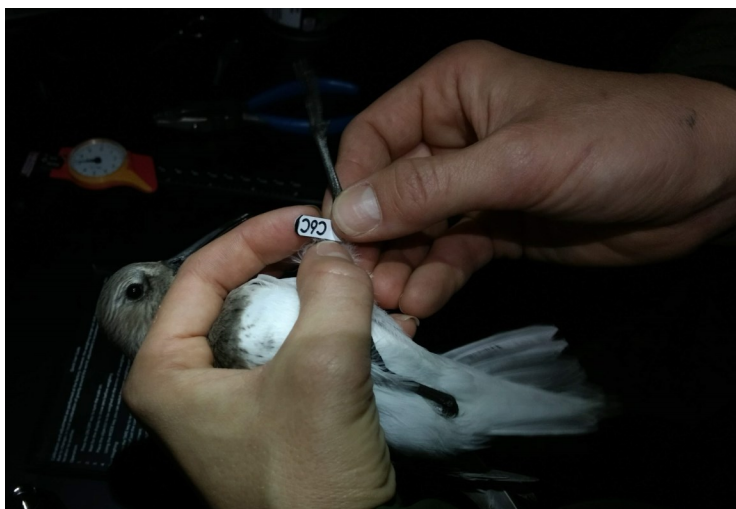
Leg flagged Dunlin, Boundary Bay