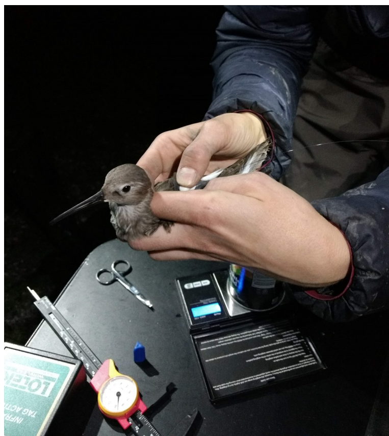
Equipping a Dunlin with a radio transmitter.