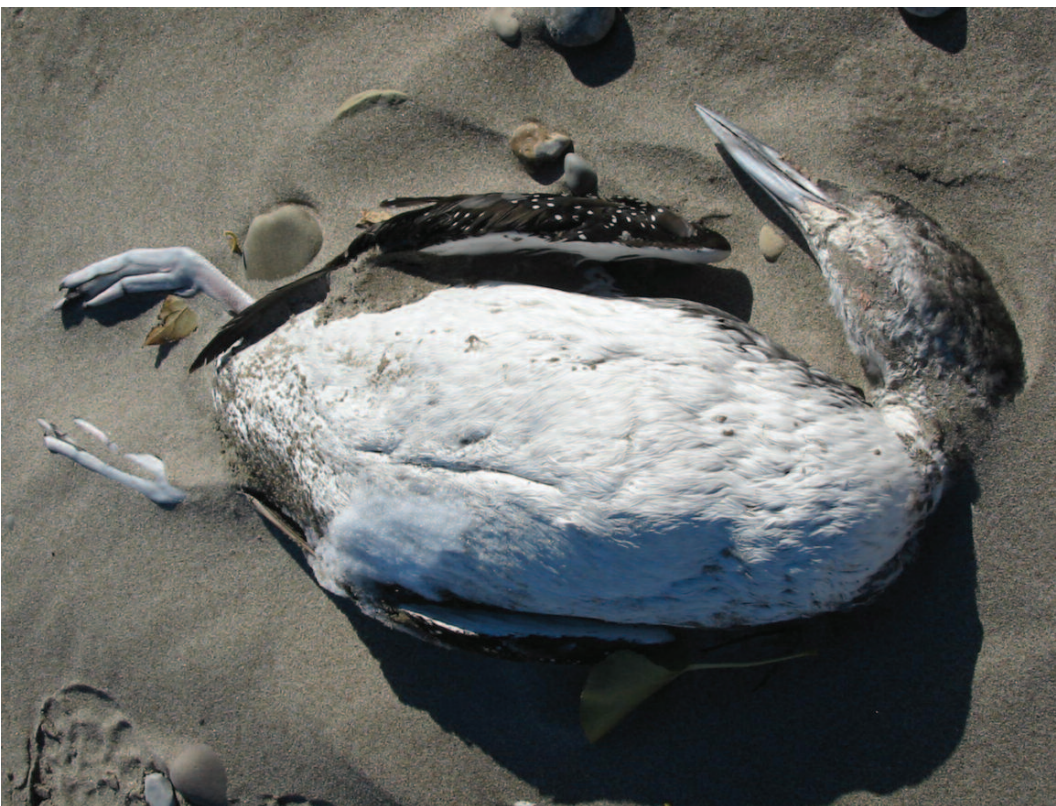
Figure 1. Tens of thousands of individuals belonging to dozens of different waterbird species, such as this Common Loon, sometimes die during late summer and autumn on Lake Erie and the other Great Lakes due to outbreaks of type-E botulism.

(Long and Trauscher 2006). The neurotoxin is one of the most potent toxins known (Singh 2000) and although many aspects of the disease have been well-studied for nearly two centuries (Cherington 2004), the function that the toxin serves for the bacteria, if there is one, remains unclear (Simpson 1986). Alternatively, the toxin may be a by-product of a complicated evolutionary history involving lateral transfer of toxin-producing genes to the bacteria, perhaps from a virus, with no obvious subsequent