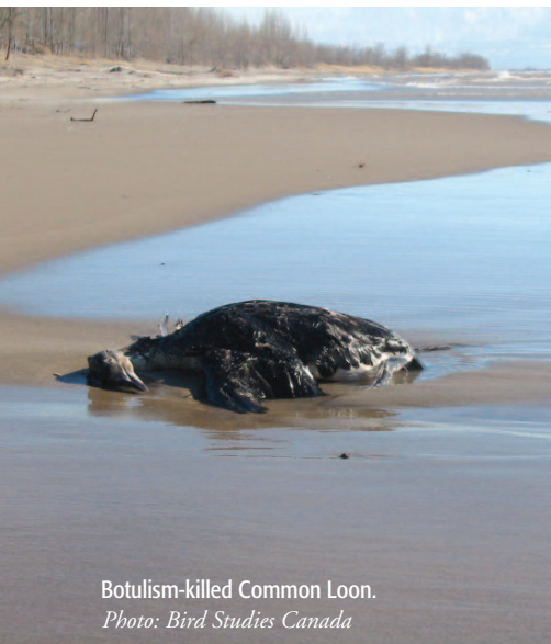
Botulism-killed Common Loon.

per pair per year) ceased to occur after 1999 when recurring type-E botulism started to spread throughout the lower Great Lakes (Figure 5).