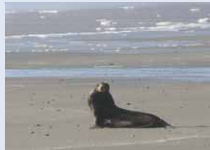
California sea lion at Schooner's Cove, Tofino

Printed on FSC 100% post-consumer fibre. Please pass this on when finished!