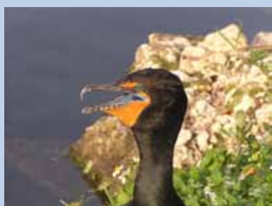
Double-crested Cormorant (N. Boyle)

Large flocks of over 100 Horned Grebes were seen at only 3 sites: 2 locations in White Rock and one site near Victoria. Fred Simpson & Ken Summers counted 306 Horned Grebes along White Rock's West Promenade in November 2010 and 208 Horned Grebes were recorded at Little Campbell River - East Pier during March 2011 (Gareth Pugh). On Vancouver Island, Mike McGrenere counted 109 Horned Grebes in November 2009 and 108 in April 2010 at Cordova Bay, near Victoria.