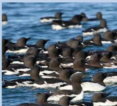
Common Murre