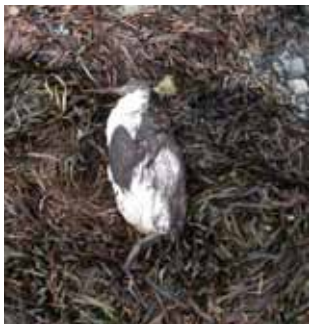
Beached Common Murre, Boundary Bay 2010

Since 2010, Bird Studies Canada has been collaborating with Environment Canada – Canadian Wildlife Service to determine how, when and where gillnet fishing may impact local marine bird populations, and Beached Bird volunteers are playing a key role in data collection. One project involves frequent beach surveys and informal beach walks to document bird mortalities and collect intact carcasses for lab analysis.