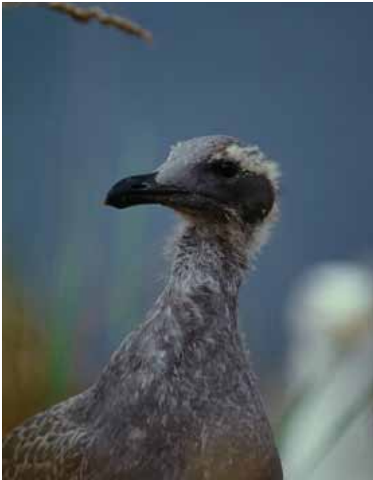
Glaucous-winged Gull chick, 40 days old

Population declines near Nanaimo were the most dramatic. In 1986, about 1600 pairs of Glaucous-winged Gulls – 12% of Georgia Basin numbers, and over 2% of the national population – were found nesting on islands in the approaches to Nanaimo Harbour. Yet in 2010, we counted only 32 nests at these sites. Snake Island, near Nanaimo, was designated as an Important Bird Area in 2001 due to its national significance to breeding Glaucous-winged Gulls and Pelagic Cormorants based on counts from 1986-1999. However these cormorants were no longer nesting there in 2010. Similar declines have been observed for other colonial nesting birds like some Great Blue Heron colonies, and other gulls and cormorants in other locations. In addition to declining population numbers, there can be other reasons why birds will cease using a breeding colony such as increased predation, disturbance, introduction of invasive species, habitat degradation and others. Clearly, these changes present a conservation and management challenge.