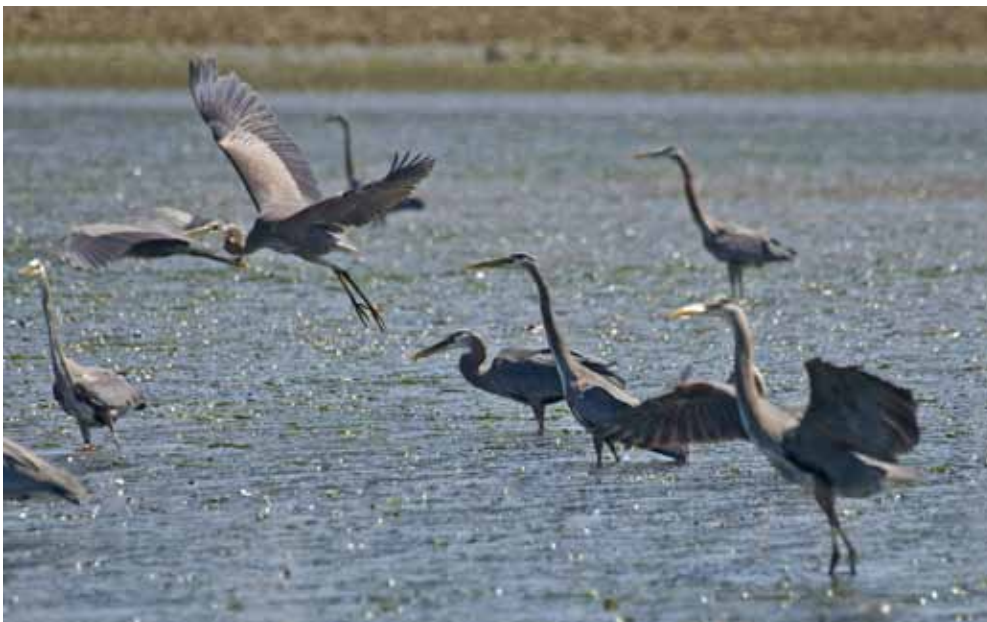
Great Blue Herons