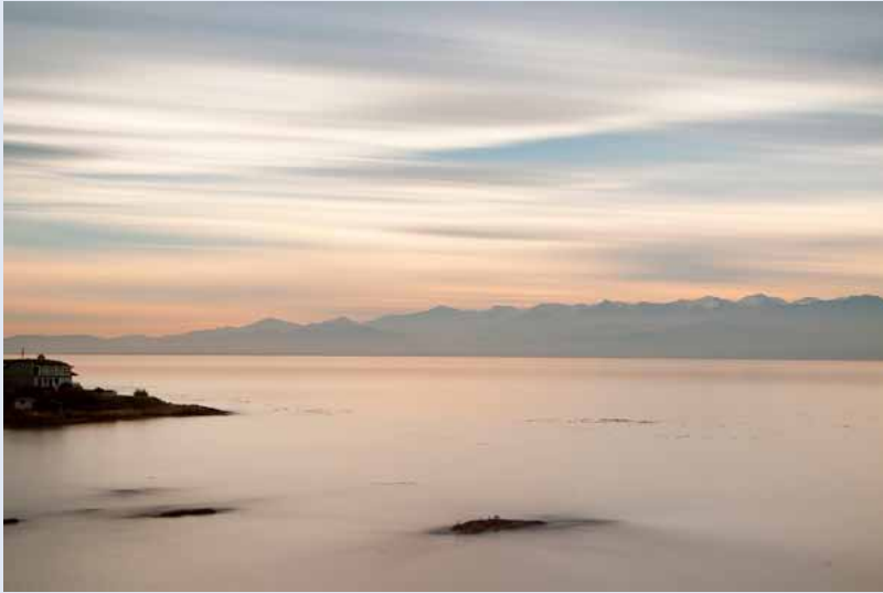
Sunrise at Gonzales Bay, Victoria