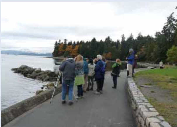
Training session at Stanley Park (David Knight)