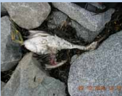
Western Grebe found in White Rock in 2010 (G. Pugh)