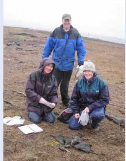
The Prentice family doing a Beached Bird survey at Blackie Spit (Marg Cuthbert)