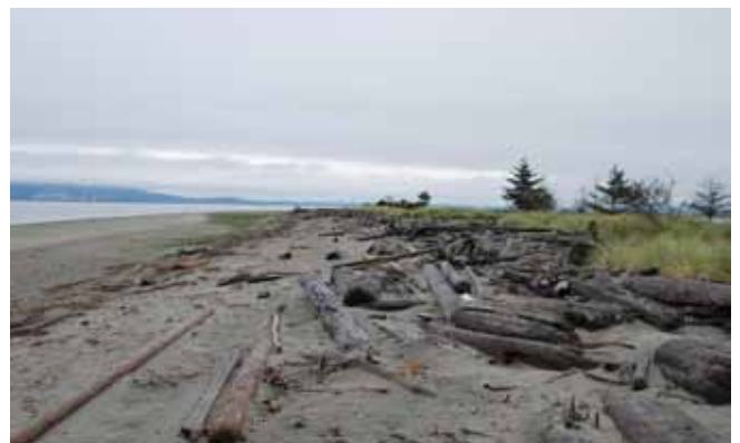
Sidney Island (K. Barry)

One of the advantages with the Beached Bird Survey program is that anyone can participate. It is suitable for any age and no special skills are required. As these students discovered, it can be great fun being out in the fresh air, walking a beautiful beach while contributing to Citizen Science monitoring programs.