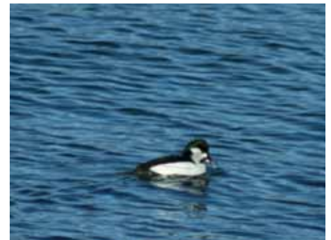
Hybrid Bufflehead x Common Goldeneye, January 2011, Vancouver