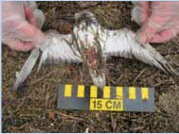
Dunlin found at Blackie Spit, Surrey in 2010 (A. Prentice)

During the last 9 years of the program from 2002 to 2010, over 2200 surveys have been conducted at more than 100 beaches although not all beaches have been surveyed continually. During this period, a total of 1063 carcasses were found during regular BB surveys and 59 species have been recorded. Of these, only 10 carcasses had oiled plumage. However in 18 separate surveys, oil was recorded on the beach or as sheen in the water. From 2002 to 2010, the most common beached bird reported was Northern Fulmar as a result of several wreck events when large numbers of these birds washed ashore on the west coast of Vancouver Island.