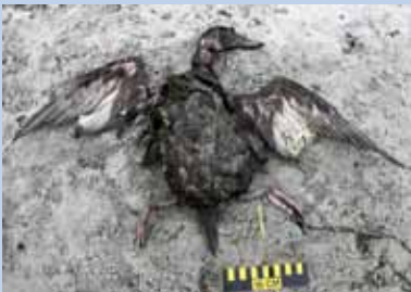
White-winged Scoter found at Willows Beach, Victoria in 2010 (H. Reid)