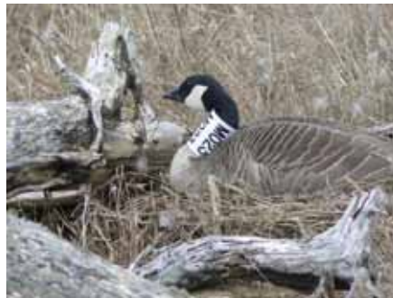
Collared Goose at Little Qualicum Estuary, March 2011

The Guardians of Mid-Island Estuaries Society is conducting field studies to document impacts from introduced Canada Geese on the Englishman River and Little Qualicum estuaries with the ultimate goal of developing a scientifically sound management strategy for non-native geese and restoring degraded estuarine habitats. The project involves installing exclosures to protect remaining sedge vegetation and monitoring revegetation, measuring channel erosion, and assessing habitat use and movement patterns of geese in the region. In 2010, almost 200 Canada Geese from Englishman River and Little Qualicum estuaries were leg-banded or fitted with neck collars to monitor movements and nesting.